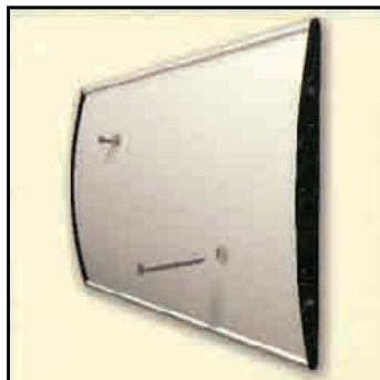
Hidden screw mounting option