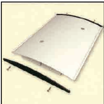
Removable end caps